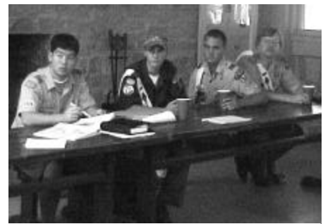
Section Officers & Dixie Committee prepare for Dixie

be sure to review the criteria in the 2001 Dixie Guidelines available online at www.SR5.org or from your lodge leadership.