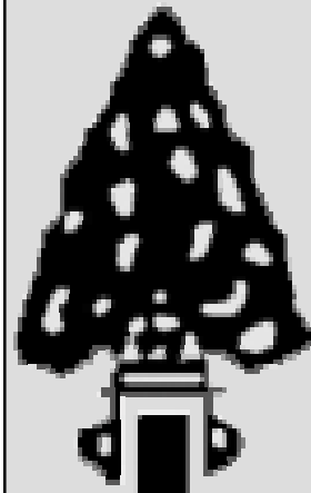
Section Officers 2007-2008