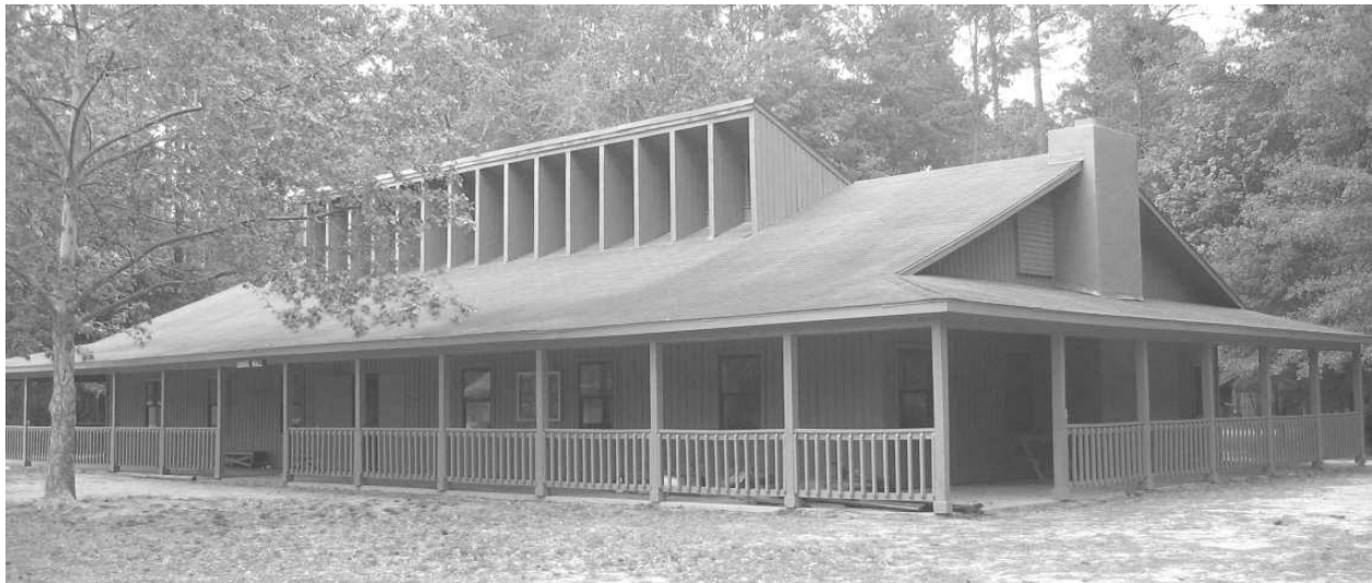
Camp Blue Heron Dining Hall